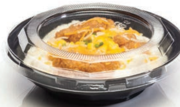
Bowl - 24009 Lid - 24400