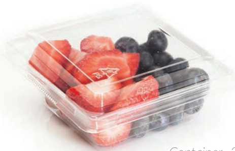
Container- 21828 Lid - 29332