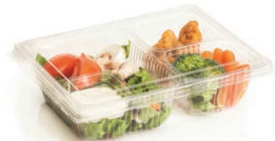
Tray - 82723 Lid - 82725