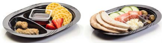
Platters Page 16