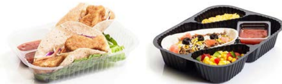
Entrée & Multi Purpose Trays Page 13-14