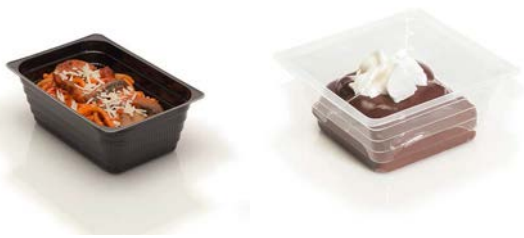
Offer Versus Serve Page 5-8