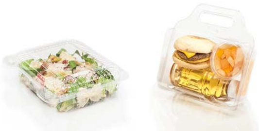
Hinged Clamshells Page 10-14