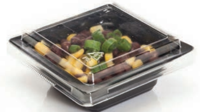
Container- 29927 Lid - 29332