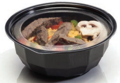
Bowl - 24025 Lid - 24500