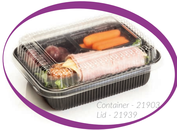
Container - 21903 Lid - 21939