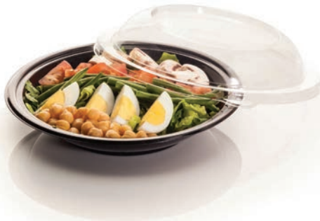
Bowl - 82638 Lid - 82639