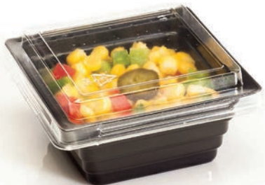
Container- 21935 Lid - 29332