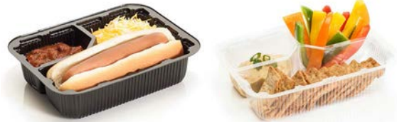
Pre-Portioned Snack Trays Page 9