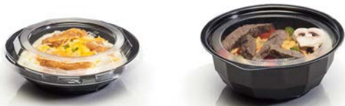
Bowls Page 15