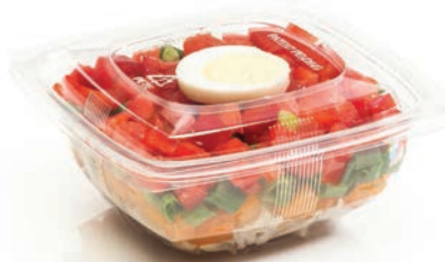
Bowl - 5BB008 Lid - 5BB200-DL