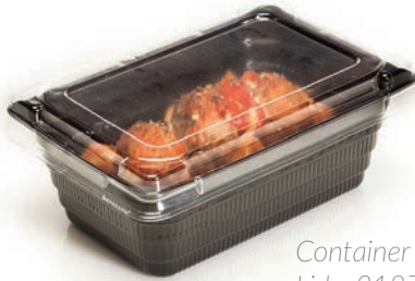
Container - 21980 Lid - 21879