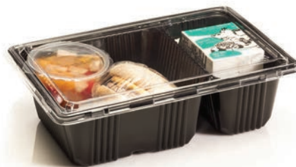
Tray - 29712 Lid - 21410